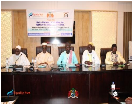
Contributions from the Panel of Chiefs

The regional Chiefs and Ex-Circumcizers in their various languages gave their own perspective of the situation as they have been yearning for their voices to be heard on this