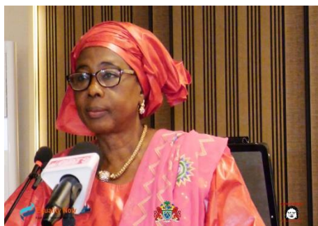
Dr. Isatou Touray Opening Statement

Expressing deep gratitude for the opportunity to address the gathering, she highlighted the significance of the occasion a policy dialogue on upholding the FGM law to protect the girl child. She emphasized the urgency in the context of the global call to end Female Genital Mutilation and violence against women and girls, and underscored the threat of repeal by some religious leaders and National Assembly members.