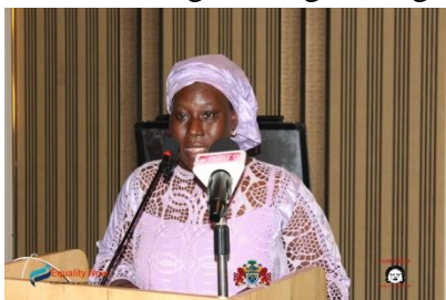
Madam Neneh Touray Ministry of GCSW

Madam Neneh Touray, representing the Minister of Gender, Children, and Social Welfare, addresses a gathering during the 16 days of activism against gender-based violence. The