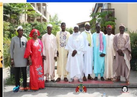
Cross Session of Different Stakeholders and Chiefs from different Regions of The Gambia